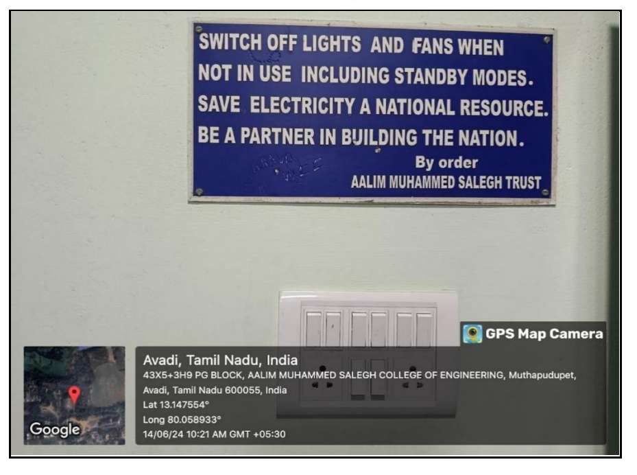
Figure: Save Electrical Energy Sign boards in appropriate places

Approved by All India Council for Technical Education, New Delhi Affiliated to Anna University, Chennai NAAC Accredited Institution & NBA Accredited Courses "Nizara Educational Campus" Muthapudupet, Avadi-IAF, Chennai - 55.