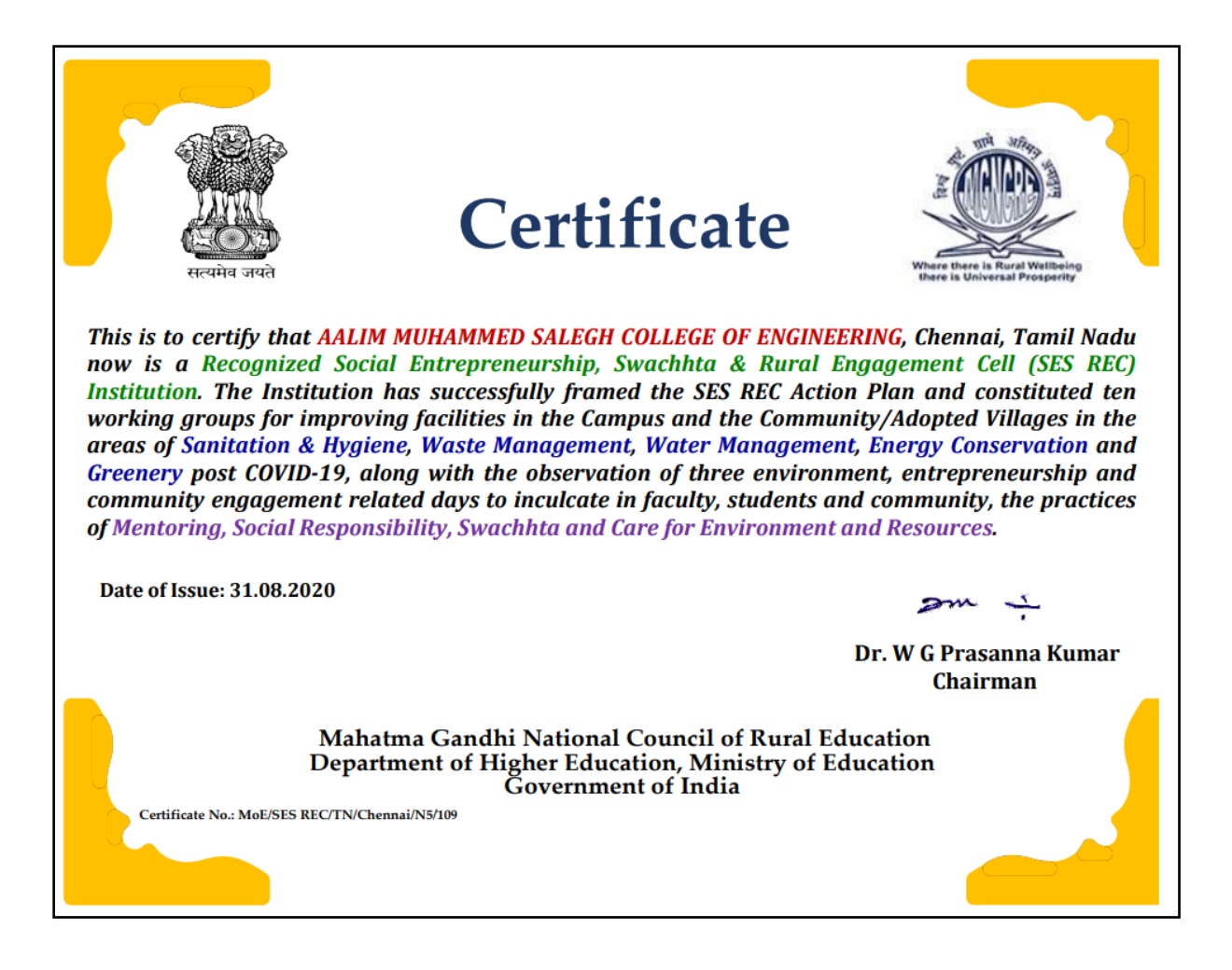
Figure: Certificate for Recognized Social Entrepreneurship, Swachhta & Rural Engagement cell Institution from MGNCRE, DHE, Ministry of Education, Govt. of India.

Institute has participated at national level as Recognized SES REC (Social Entrepreneurship, Swachhta & Rural Engagement Cell) Institution, Mahatma Gandhi National Council of Rural Education, Department of Higher Education, Ministry of Human Resource Development, Govt. of India for improving the facilities in the campus and community in the areas of Sanitation & Hygiene, Waste Management, Water Management, Energy Conservation and Greenery.