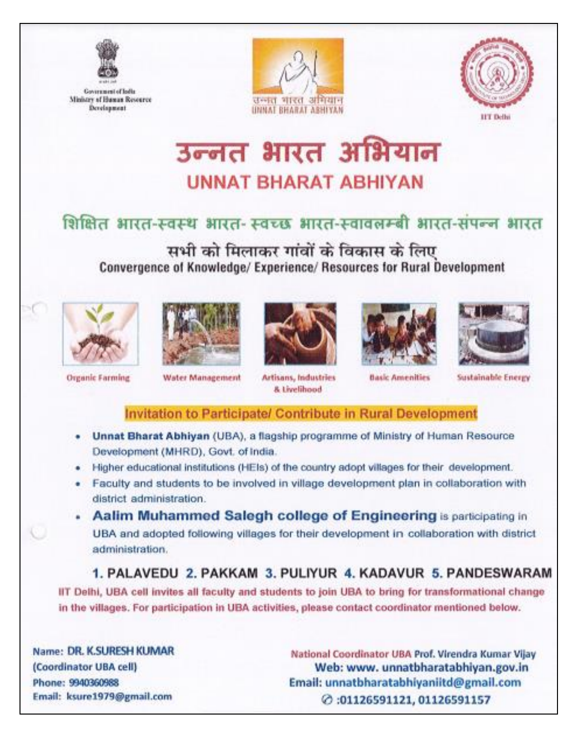
Figure: UBA participating certificate