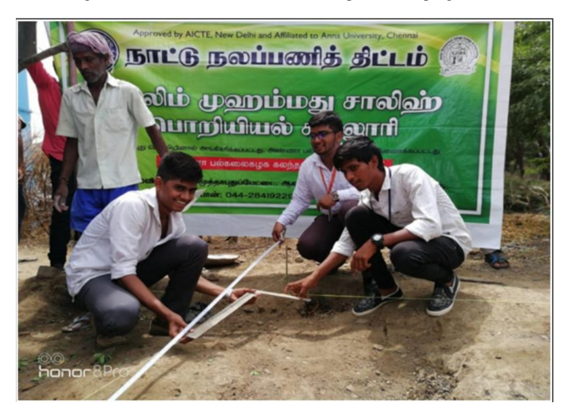
Figure: Swachh Bharat Summer Internship -2018-19 programme