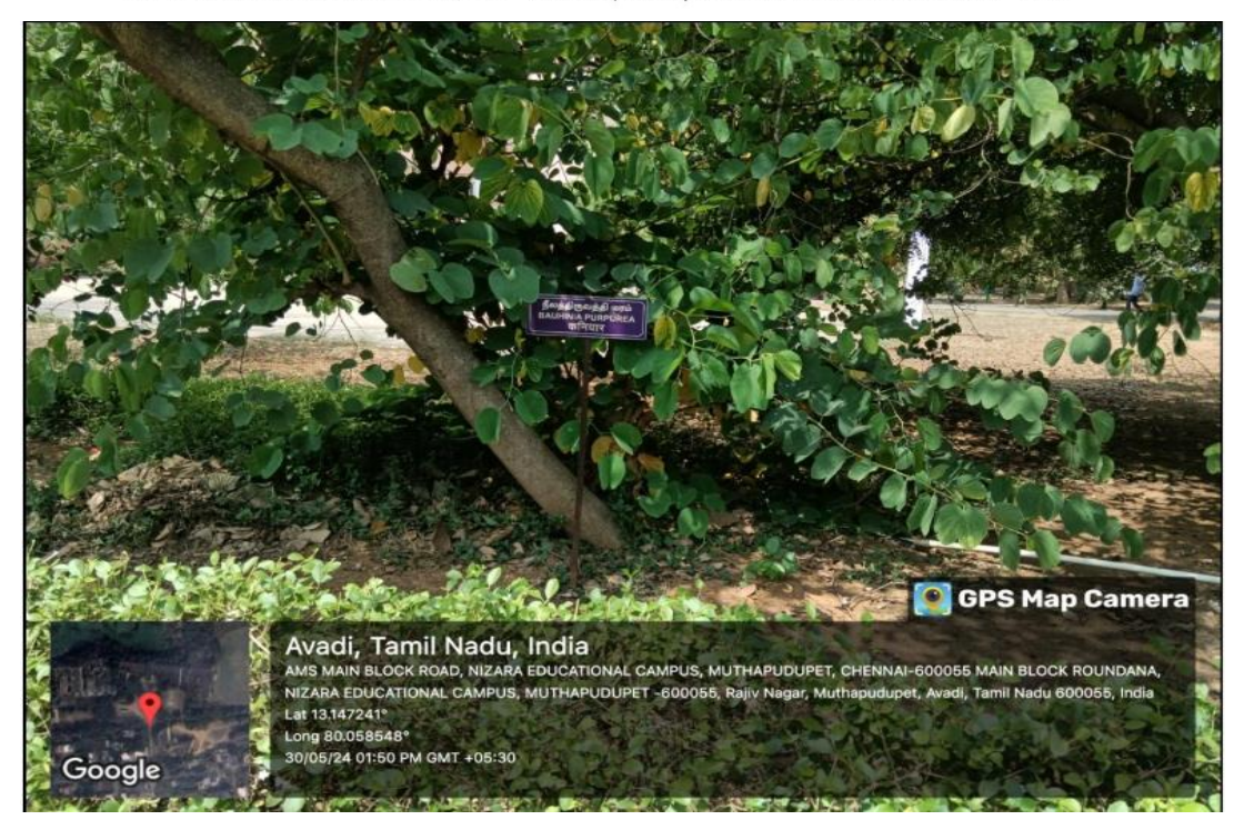
Figure: Botanical names displayed in and around College Campus.

Approved by All India Council for Technical Education, New Delhi Affiliated to Anna University, Chennai NAAC Accredited Institution & NBA Accredited Courses "Nizara Educational Campus" Muthapudupet, Avadi-IAF, Chennai - 55.