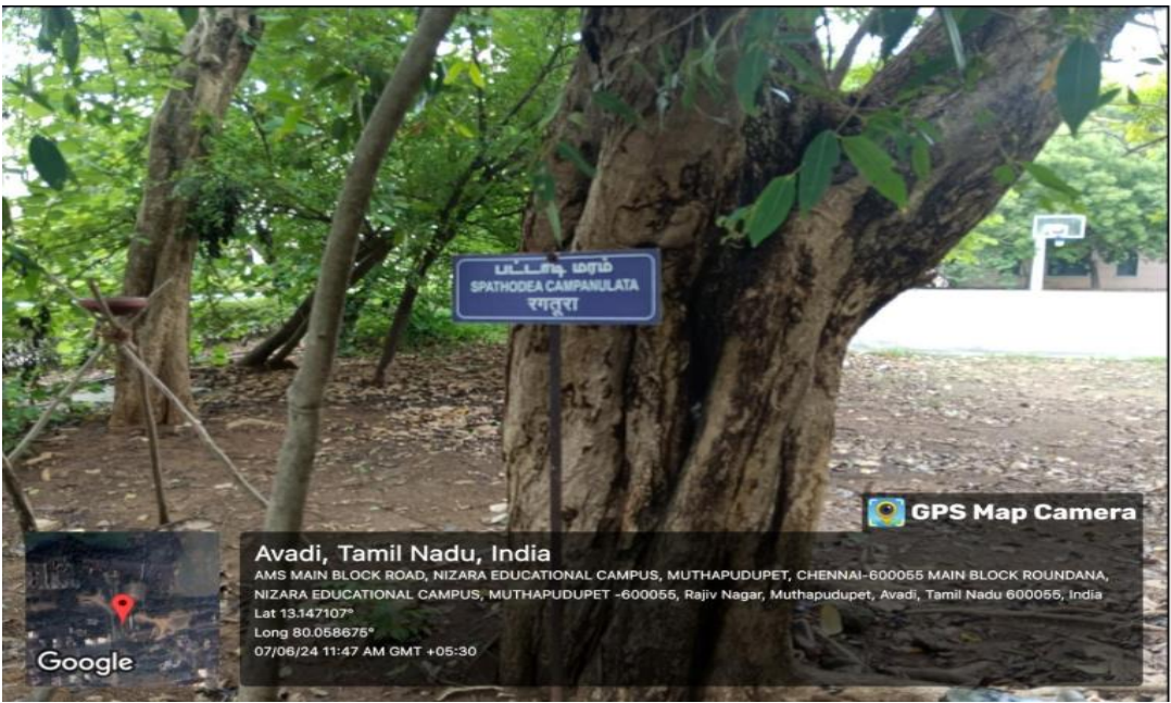
Figure: Botanical names displayed in and around College Campus.

As a part of Green initiatives, Botanical names of the trees in three languages (Tamil, English and Hindi) were displayed in and around College Campus.