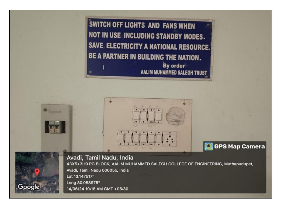
Figure: Save Electrical Energy Sign boards in appropriate places

As a part of Green initiatives, Save Electrical Energy Sign boards are placed in appropriate places