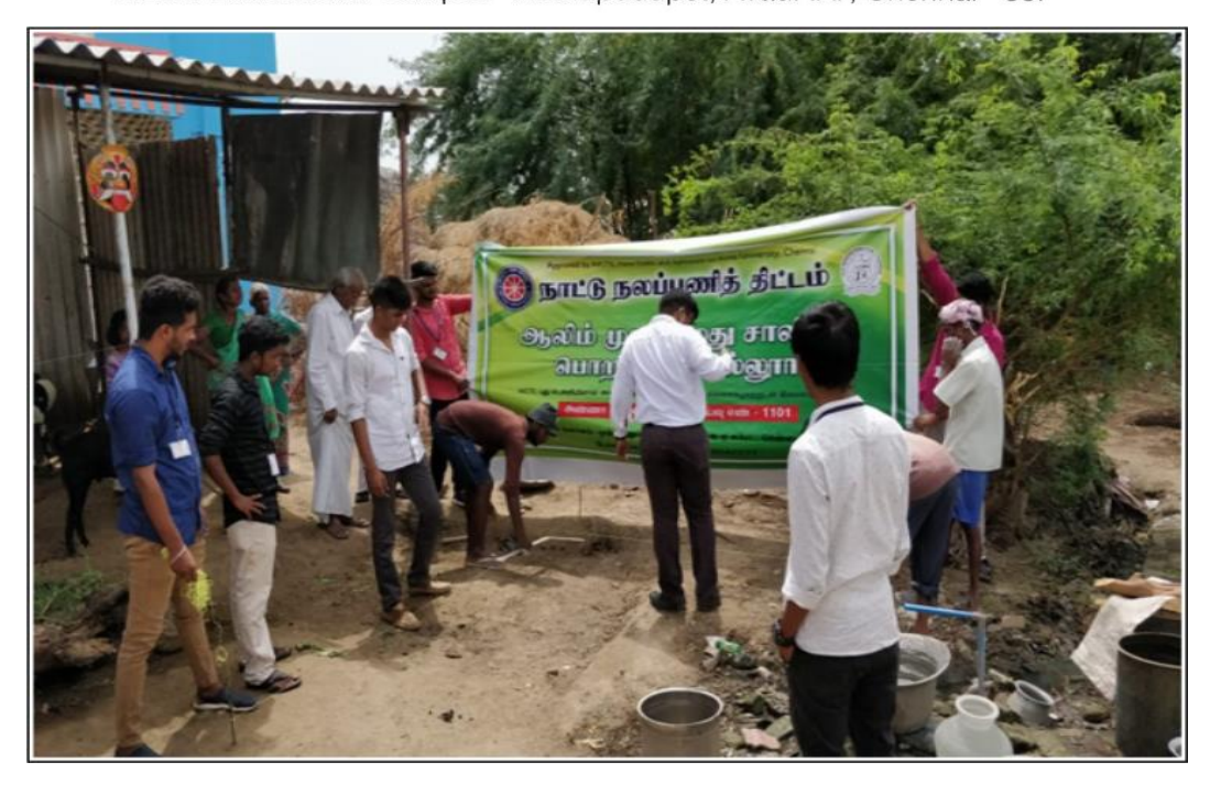
Figure: Swachh Bharat Summer Internship -2018-19 programme

Approved by All India Council for Technical Education, New Delhi Affiliated to Anna University, Chennai NAAC Accredited Institution & NBA Accredited Courses "Nizara Educational Campus" Muthapudupet, Avadi-IAF, Chennai - 55.