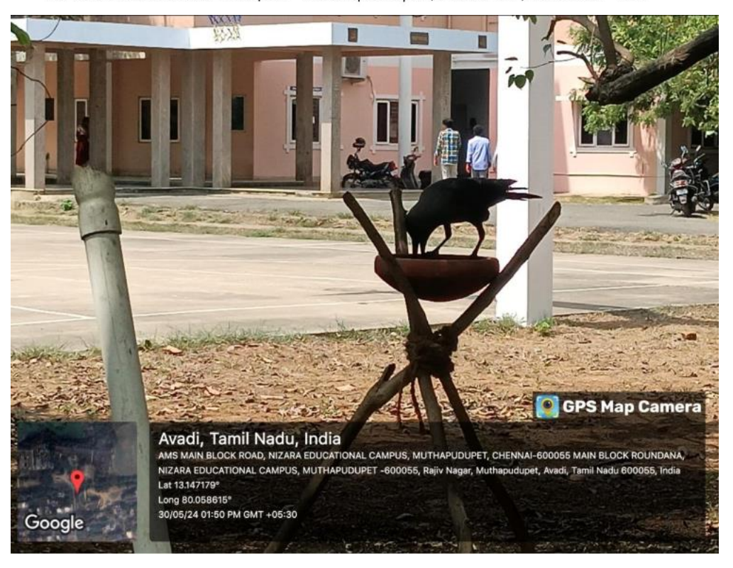
Figure: Bird Water Feeders were kept in and around College Campus.

Approved by All India Council for Technical Education, New Delhi Affiliated to Anna University, Chennai NAAC Accredited Institution & NBA Accredited Courses "Nizara Educational Campus" Muthapudupet, Avadi-IAF, Chennai - 55.